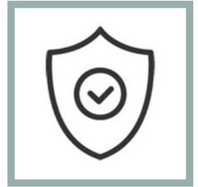
Fire & Security Alarms