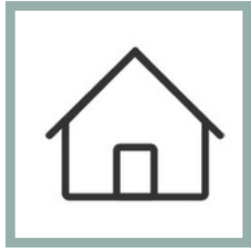
Rent & Rates