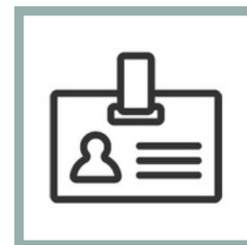
Manned Reception during working hours and 24/7 access / secure door entry system