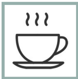
Tea & Coffee Facilities