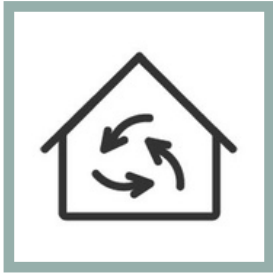
Energy & Utilities