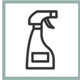
Cleaning & Maintenance