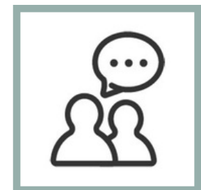
Networking & collaboration opportunities with organised social events

The main benefits of our serviced office suites are ease, flexibility and total transparency via all-inclusive monthly pricing. We offer short, 4 month contracts providing the stability of fixed overheads with the convenience and flexibility of easy in/out space that can grow and flex as needed for total peace of mind.