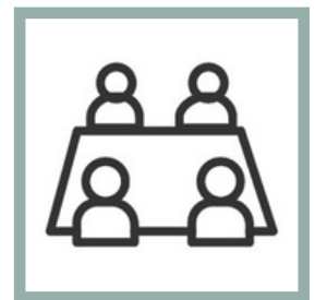
Preferential rates on Meeting Rooms