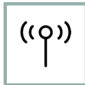
Professional, business grade, gigabit fibre internet