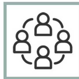
Access to breakout area