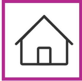
Rent & Rates