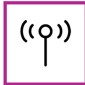
Professional, business grade, gigabit fibre internet