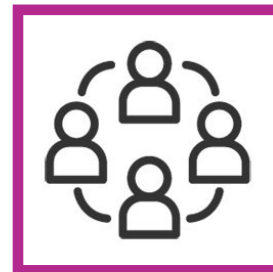
Access to breakout area