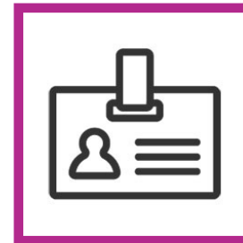
Manned Reception during working hours and 24/7 access / secure door entry system