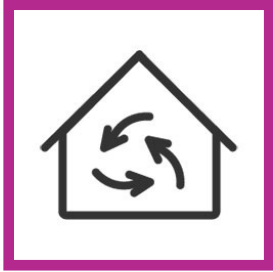
Energy & Utilities