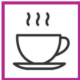
Tea & Coffee Facilities