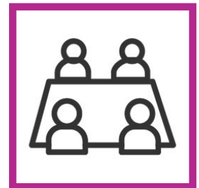
Preferential rates on Meeting Rooms