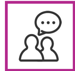
Networking & collaboration opportunities with organised social events

The main benefits of our serviced office suites are ease, flexibility and total transparency via all-inclusive monthly pricing. We offer short, 4 month contracts compared to 12 months plus with traditional commercial leases, providing the stability of fixed overheads with the convenience and flexibility of easy in/out space that can grow and flex as needed - perfect for businesses and professionals who aren't sure how long they will need office space for or how quickly they are going to grow.