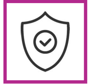
Fire & Security Alarms