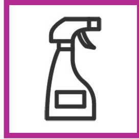
Cleaning & Maintenance