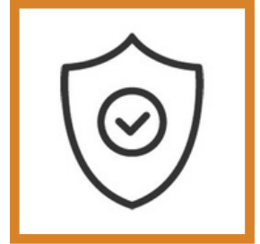
Fire & Security Alarms