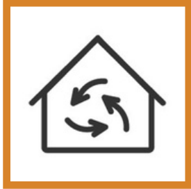
Energy & Utilities