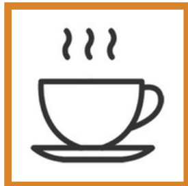
Tea & Coffee Facilities