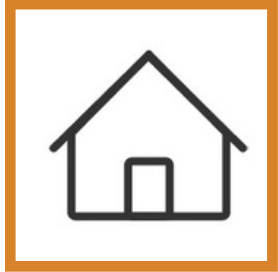
Rent & Rates