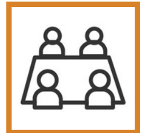
Preferential rates on The Cellar (meeting room)