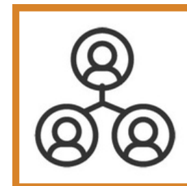
Managed by The Sanderum Centre with two other Centres