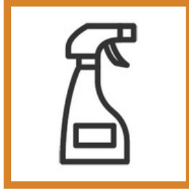
Cleaning & Maintenance