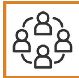
Access to The Hub (co-working spaces)