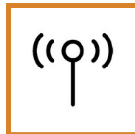
Professional, business grade internet (80:80 Mbps upload and 80 Mbps download)