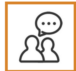
Networking & collaboration opportunities

The main benefits of our serviced office suites are ease, flexibility and total transparency via all-inclusive monthly pricing. We offer short, 4 month contracts compared to 12 months plus with traditional commercial leases, providing the stability of fixed overheads with the convenience and flexibility of easy in/out space that can grow and flex as needed - perfect for businesses and professionals who aren't sure how long they will need office space for or how quickly they are going to grow.